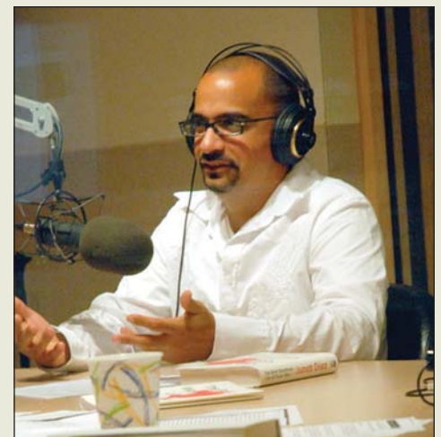
Junot Diaz during a radio interview

With sales of more than 85 million books in 63 languages worldwide, Brazilian Paulo Coelho is one of the world's most beloved and prolific writers of mystery and spirituality. "Brida," one of his early novels, is now available for the first time in English. The book chronicles the quest of Brida O'Fern, a lovely young Irish girl who seeks knowledge and understanding of the world's magic and receives many unexpected gifts from her mentors along the way.