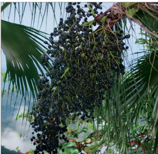
Açaí, perhaps the most powerful superfood, is nearly impossible to find fresh as it grows only in Brazil, but a dried concentrate is available in many markets.

The açaí (ah-sigh-ah-ee) berry is the tropical fruit scooping up the most attention at the moment — and with good reason. A little larger than a blueberry, this tidbit's antioxidant and vitamin potency is twice as big. A generous share of anthocyanins does more than give the berry its deep amethyst color: These flavonoids can help prevent blood clots, improve circulation, relax blood vessels and prevent atherosclerosis. And as if that's not enough to make this unassuming little fruit "super," each berry is also stuffed with amino acids, essential fatty acids and plant sterols, which protect the immune system. Recent studies indicate that açaí might even fight cancer.