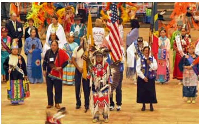
The Festival Color Guard, composed of American military veterans, upholds the Native American tradition of honoring warriors.